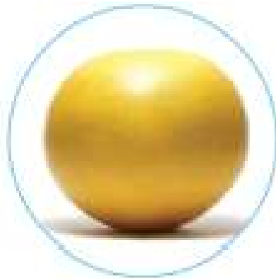
1 LB OF FAT