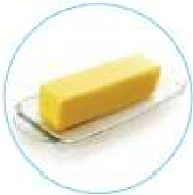
1/4 LB OF FAT